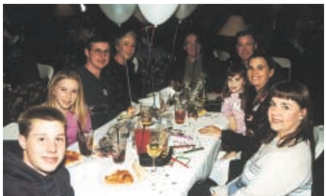
(Below) There was pizza for the younger set and bags of take-home New Year's party favors for all the Gerald Silverberg crew.